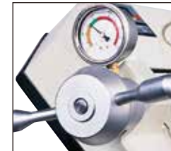
Hydraulic Tension Meter (optional)