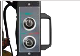
HB System Dual Function for RF-210V (Inverter Variable Manual & Hydraulic Cutting Speed Single Phase Only) (option for RF-210 only)