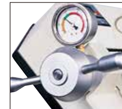
Hydraulic Tension Meter (optional)