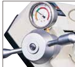
Hydraulic Tension Meter (optional)