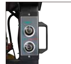
HB System Dual Function for Manual & Hydraulic Cutting (optional)