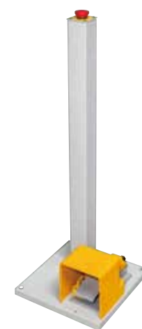
Foot pad & Emergency switch for RF-420VAA