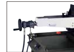
Hydraulic Vise for "AA" series