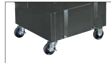
Optional Wheel for your selection