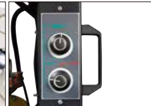
HB System Dual Function for RF-270V (Inverter Variable Manual & Hydraulic Cutting Speed Single Phase Only) (option for RF-270 only)